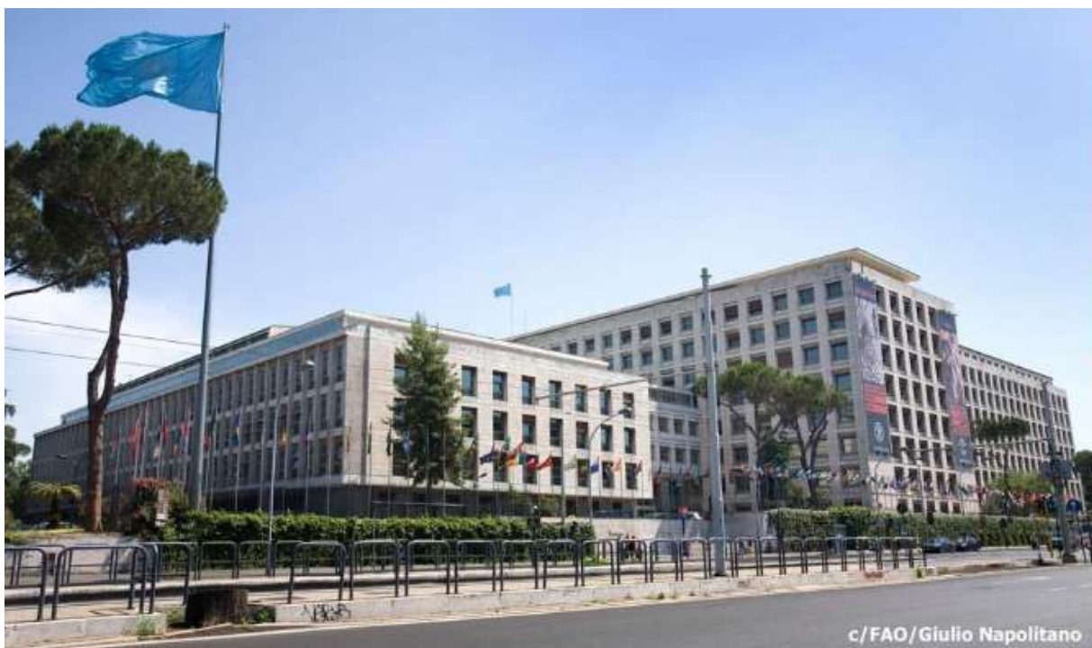
Picture of the FAO building

FAO headquarters is centrally located in Rome, near the Circo Massimo metro station and within walking distance of the Colosseum. The easily recognizable white building is also accessible from Ostiense train station, which is about a 15–20-minute walk away.