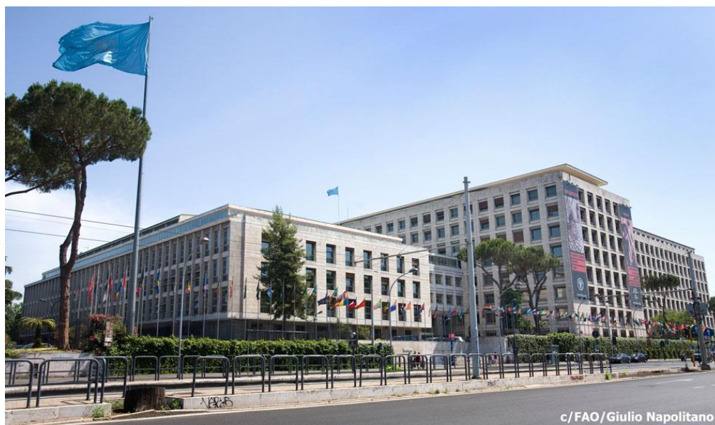
Picture of FAO building

The FAO Headquarters are located in the city center of Rome, near the metro station 'Circo Massimo' and close to the Colosseum. It is a lofty white building that is easy to recognize. Ostiense is the closest train station (15-20 min walking).